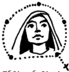
El Mes de Maria Month of Mary

The Crowning of Mary will be on Sunday, May 7 th . During the month of May, please have your children bring flowers to our Blessed Mother. They can proceed in with Father. A child will be selected at each Mass to crown Mary.